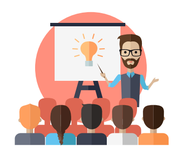
DELIVERED 29,500 SESSIONS